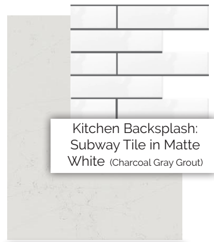
Quartz Countertops in Altena