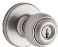
Door Handles: Standard Nickel Knob