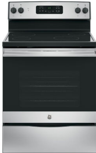
30" Free-Standing Electric Range, Glass Cooktop, Self Clean JB625