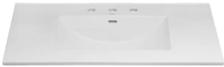
Vanity Top: Wave Bowl in White Cultured Marble