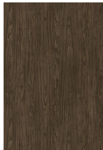
Cabinets: Flat Panel Doors in Tete a Tete