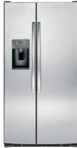
Refrigerator 25.3 cu ft, Side-by-Side, Ice & Water GSE25