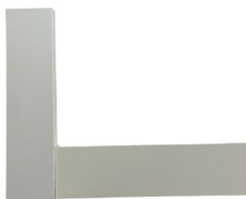
Moulding: MDF 4.25" Baseboards & 3" Casing in White