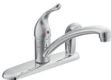
Plumbing & Faucets: Chrome

The Foothills Package is an affordable addition to our Classic Series. Refer to Classic Series brochure for all available floor plans.