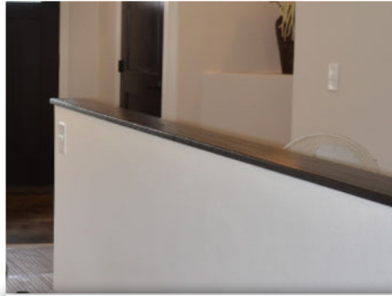
Stairwells: Half wall or full wall