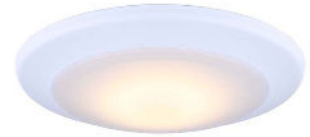
Lighting: LED Throughout