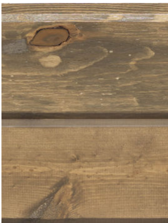
Pine Paneling in Pewter