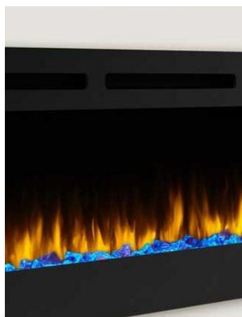
Fireplace: Simplifire Allusion Electric