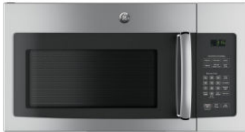
Over the Range Microwave 1.6 cu ft, 300 cfm, 950 watt, Recirculating Venting JNM3163