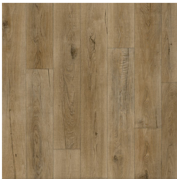
Flooring Throughout: Congoleum Vinyl in Natural