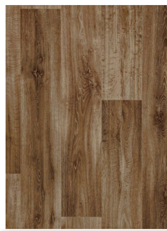
Waterproof BeauFlor LVP in Walnut