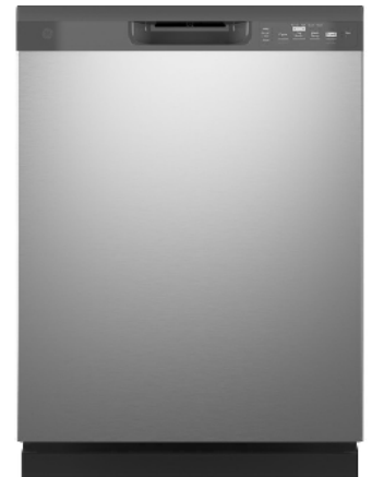
Dishwasher 4 Cycle GDF511